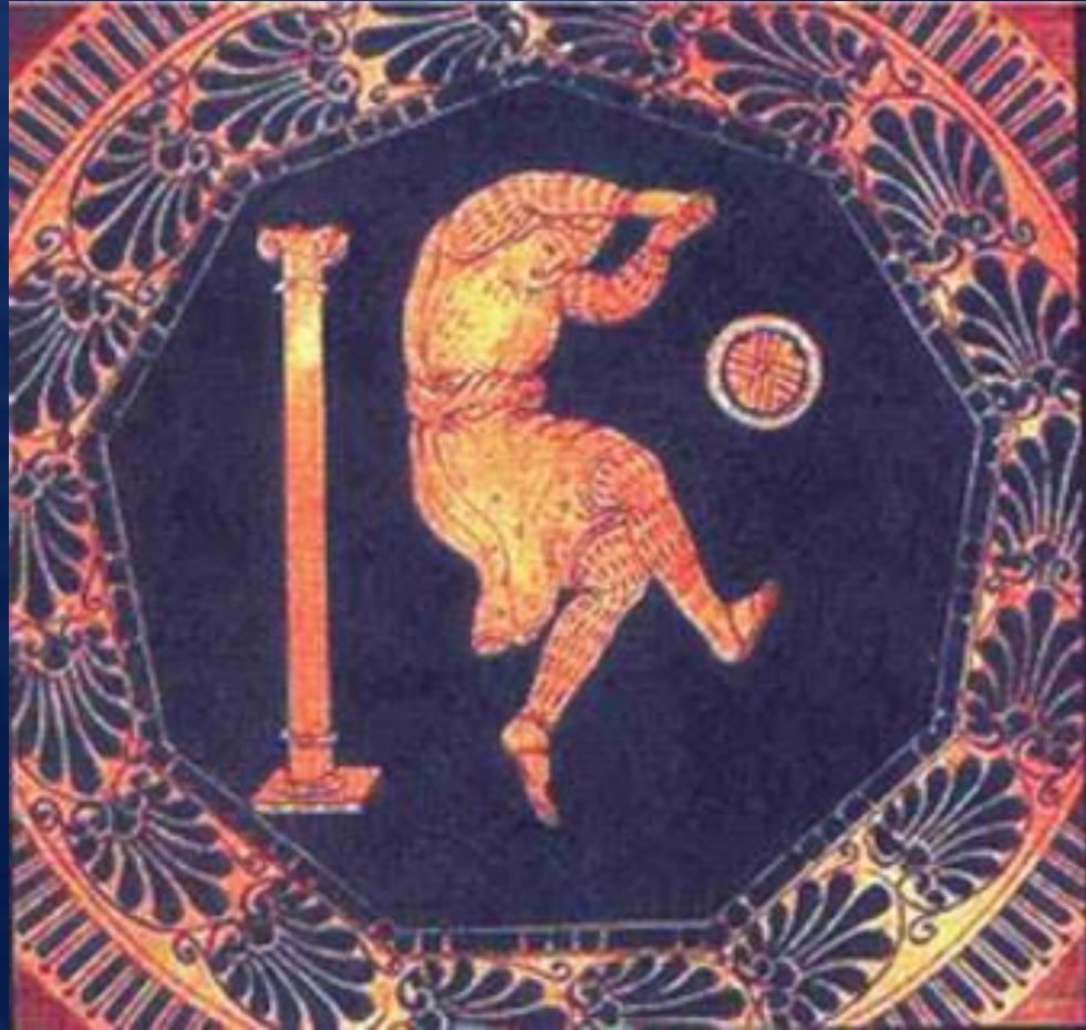
Woman playing with a football, 4 TH Century BC, Athens

The Athens Women's Football Summit is part of the fight to nurture positive social change and achieve women's equal footing in football. It is a gathering with the purpose of promoting diversity and true inclusion of women in the sport, building an international consensus around the goals and means to be pursued, and fostering global investment opportunities in women's football - all while equipping attendees with the skills, confidence and contacts that they need to continue pushing forward.